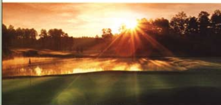
Daybreak on the 10th green

It's generous Tiftway II 149 Bermuda fairways crosscut to 1 13/16". It's bent grass greens that putt fast and true. And no out of bounds.